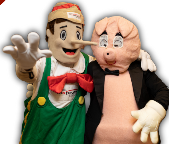
CTF Mascots - L: Fibber R: Porky

73,718 Donations < $1,000 1,140 Donations > $1,000